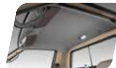
MOULDED ROOF WITH INTEGRATED ROOF LAMP