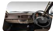
DUAL TONE INTERIORS