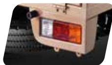
TAIL LAMP PROTECTOR